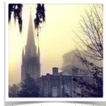
Above: St. John's Episcopal Church. Bottom: Detail of lower sash of Strachan window depicting the Good Shepherd.